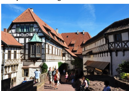
Way to Wartburg