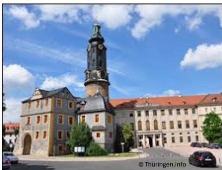
City Castle of Weimar